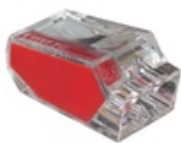
Red 2-Port PushGard Push-in Wire Connector