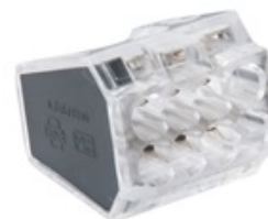
Black 8-Port PushGard Push-in Wire Connector

Gardner Bender Wire Connectors are engineered to exceed the expectations of professional electricians. Perfect for commercial or residential applications GB Wire Connectors offer world-class quality, performance, and application versatility.