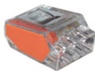
Orange 3-Port PushGard Push-in Wire Connector