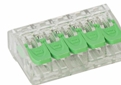
LeverGard 5-port lever connectors

GB's LeverGard wire connectors have the ability to secure both stranded and solid