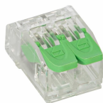
LeverGard 2-port lever connectors