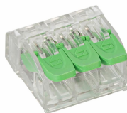
LeverGard 3-port lever connectors